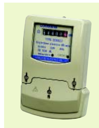
DDS523-(F) Transparent cover

At using the meters, customers can get signal samples through enlargement, multiplication, integral, V/F exchange and divided frequent power on the dividAed current and divided voltage meters to drive stepping motors and counters add up energy degrees.