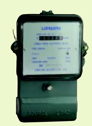
DDS523-(J) Iron base Glass cover