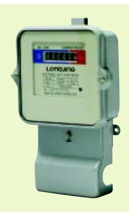
DDS523-(K) Iron base Glass cover