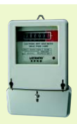
DDS523-(L) Glass cover